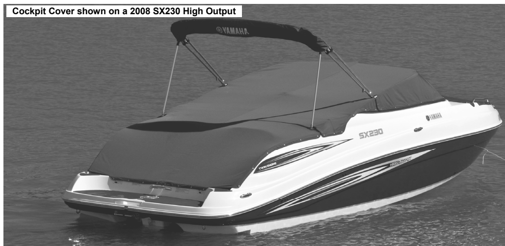
Cockpit Cover shown on a 2008 SX230 High Output

* Part supplied with kit only and not available separately.