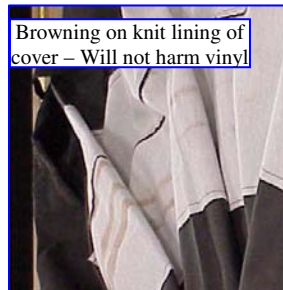
Browning on knit lining of cover – Will not harm vinyl