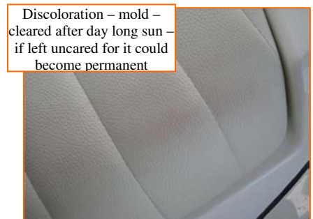
Discoloration – mold – cleared after day long sun – if left uncared for it could become permanent